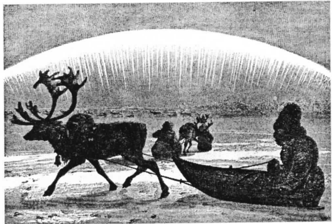
The tinkling bell at the neck of this reindeer is intended to keep the ominous influence of the lights at a safe distance.

Harry Somers has become one of Canada's internationally respected composers in the course of a career spanning nearly five decades. A native of Toronto, he has written extensively for opera, ballet, stage, film, television, orchestra, soloist(s) with orchestra, chamber music, chorus, solo voice, and piano. He is an associate of the Canadian Music Centre, and a founding member of the Canadian League of Composers.